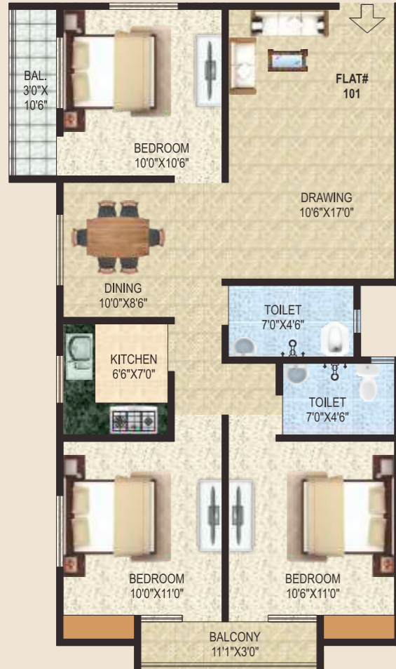
Flat No. 101 / 102