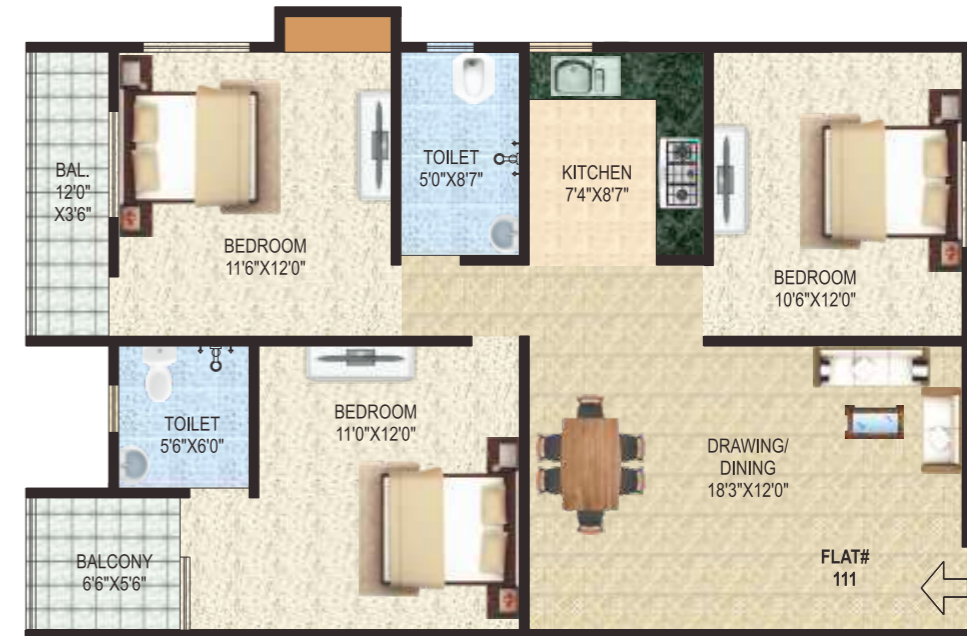
Flat No. 105 / 106 111 / 112