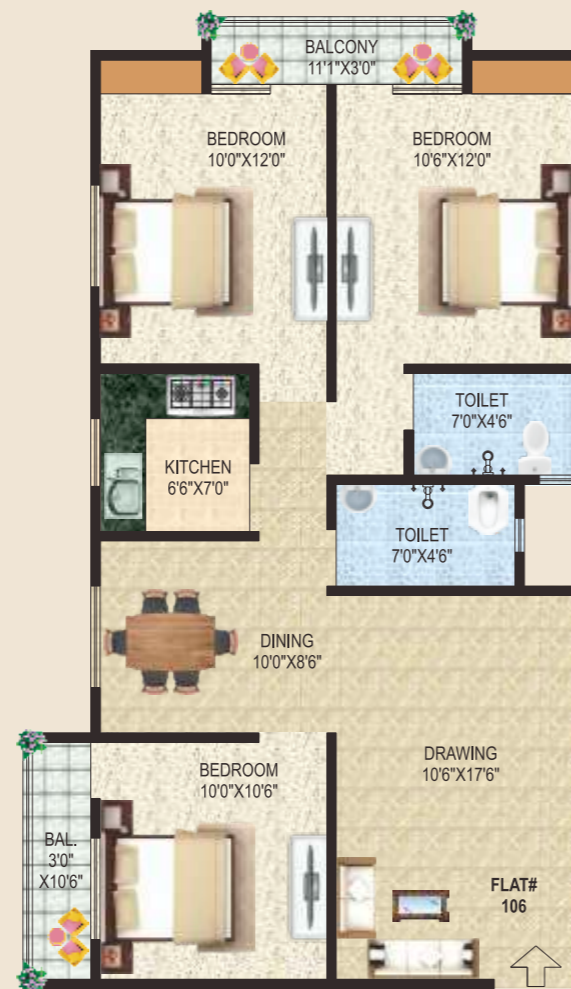
Flat No. 105 / 106