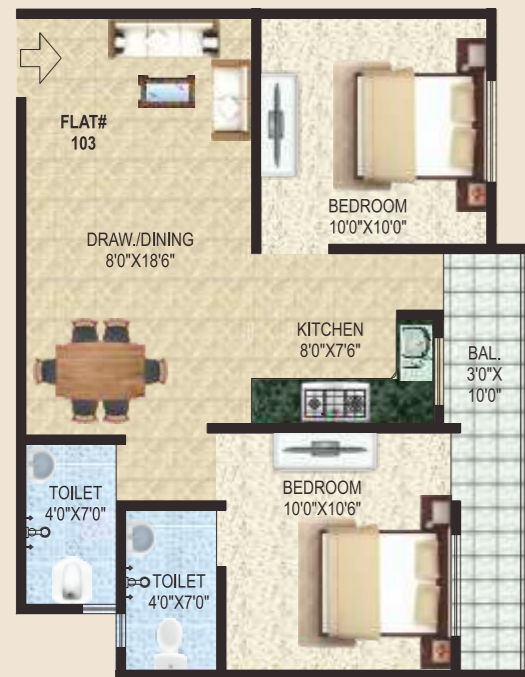
Flat No. 103 / 107