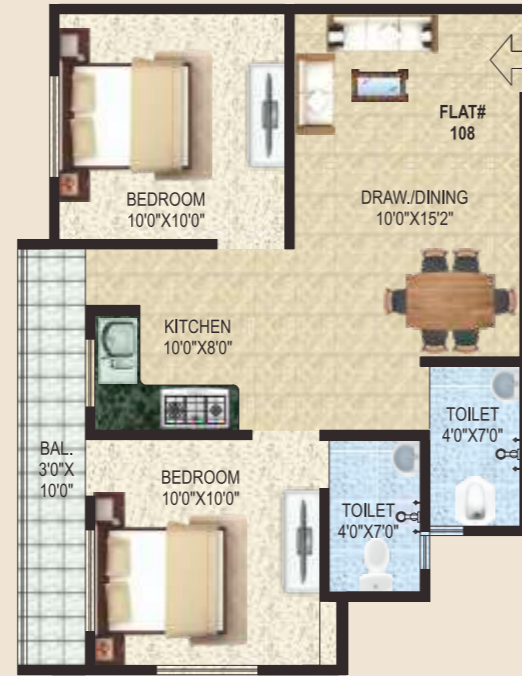
Flat No. 104 / 108