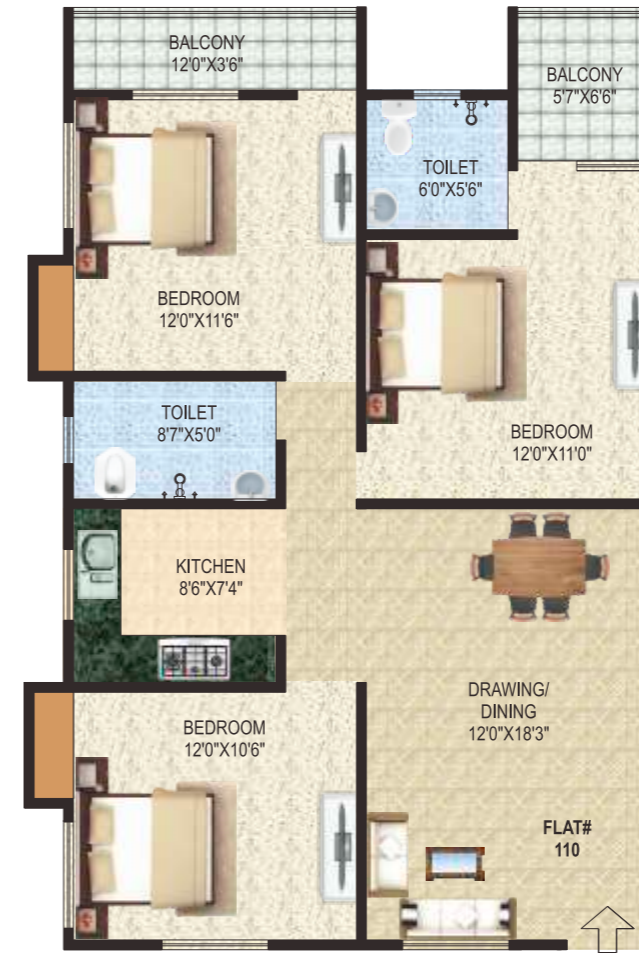
Flat No. 101 / 102 / 103 / 104 107 / 108 / 109 / 110