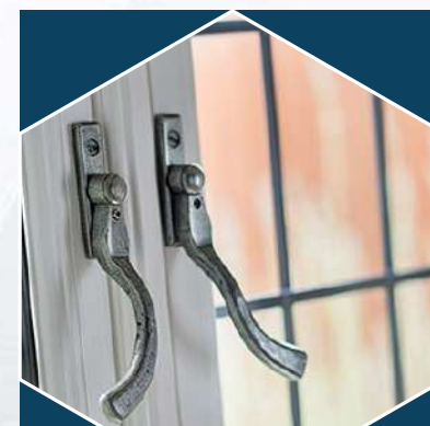
PREMIUM QUALITY DOORS