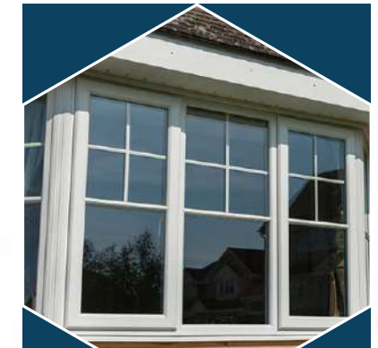
ALL UPVC COATING WINDOWS