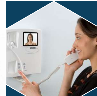
VIDEO DOOR PHONE