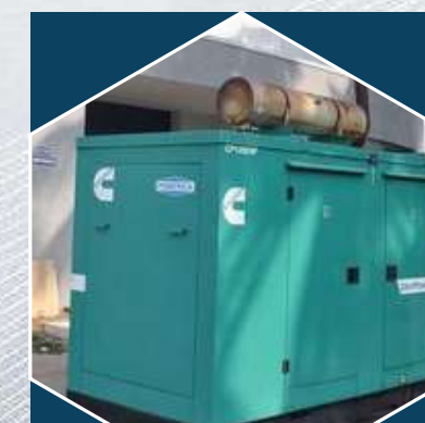
POWER BACKUP 24X7